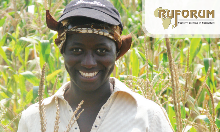
Training the Next Generation of Scientists for Africa