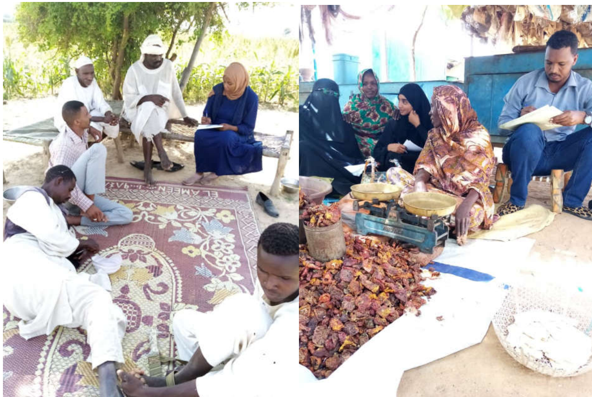
Students undertaking evaluations on indigenous knowledge of the traditional famine-food preparation and availability in North Darfur, Sudan under the vegetable and non-timber CARP

apical rooted cuttings—a departure from the conventional multiplication using tubers, which spreads diseases and pests; and, a seed potato production unit with two crops with the Kenya Plant Health Inspectorate Service (KEPHIS).