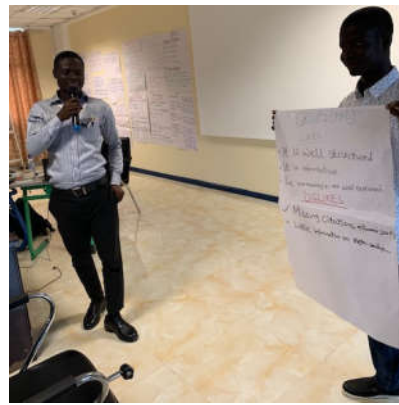
Students engaging in the Thesis Proposal Development, Scholarly Writing and Presentations training