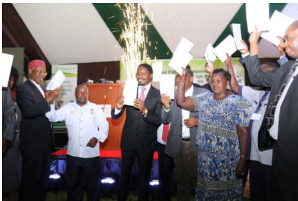
Launch of the Crops (Solanum Potato) Regulations 2019 by Hon. Mwangi Kiunjuri, the CS for Agriculture, Livestock, Fisheries and Irrigation

The Secretariat continued to support implementation of interdisciplinary and multi-agency research in the 16 Community Action Research Programmes operational in Benin (Baobab value chain); Kenya (Cassava, Potato value chains); Uganda (Rice, Pig and Potato value chain ); Ghana (Pineapple value chain ) –Zimbabwe (Water Harvesting value chain); South Africa (Wool value chain); Botswana (Safflower value chain); -Namibia (encroacher bushes value chain); and, Sudan (Honey Bee, Natural Resources Management, vegetable and non-timber