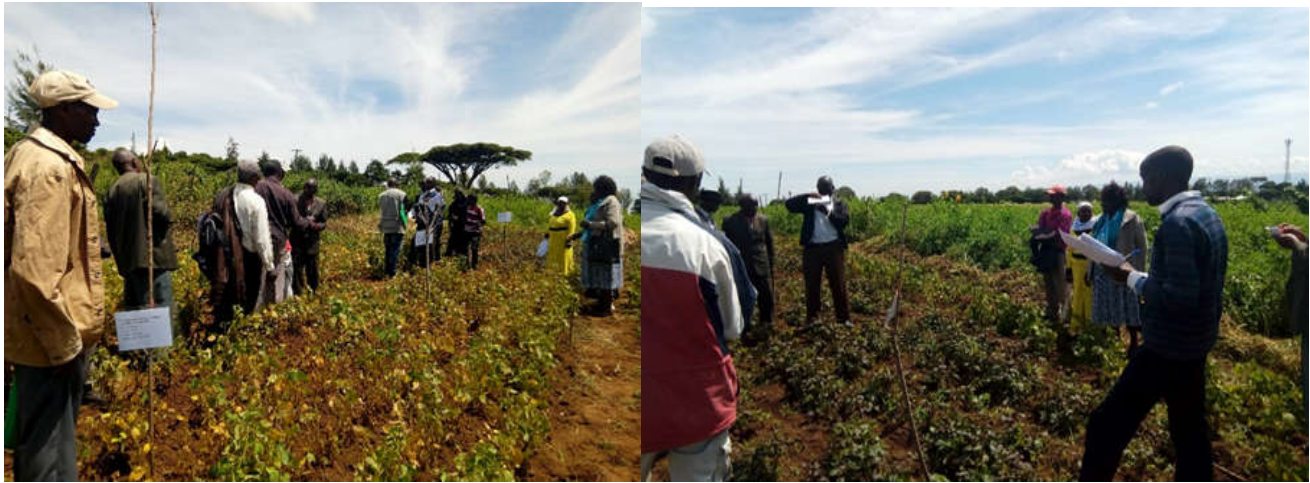
Students undertaking participatory field evaluation of soybeans with smallholders in Kenya