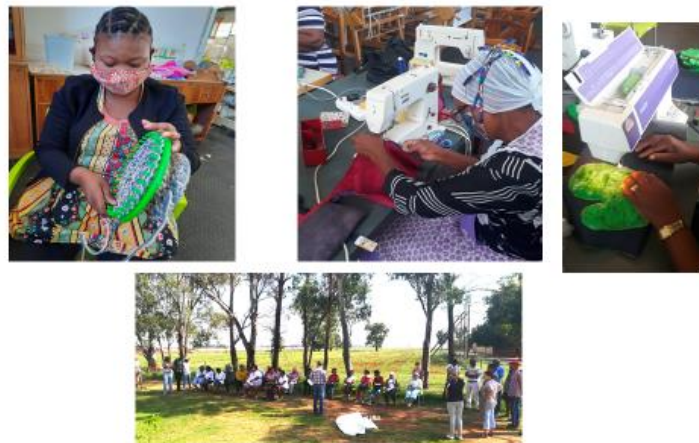
University of Free State Community Engagement and Skilling of rural women in wool value addition

training, business planning, business management and industry input on training. It is also important to build networks / partnerships – private sector – government – academia (including universities and TVET engagement), taking hands on mentorships