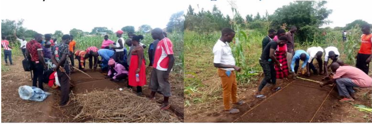
Picture: Out of school youth under-going practical skills development at Bobi Polytechnique, northern Uganda

Key lessons from RUFORUM engagement with the out of youth includes: