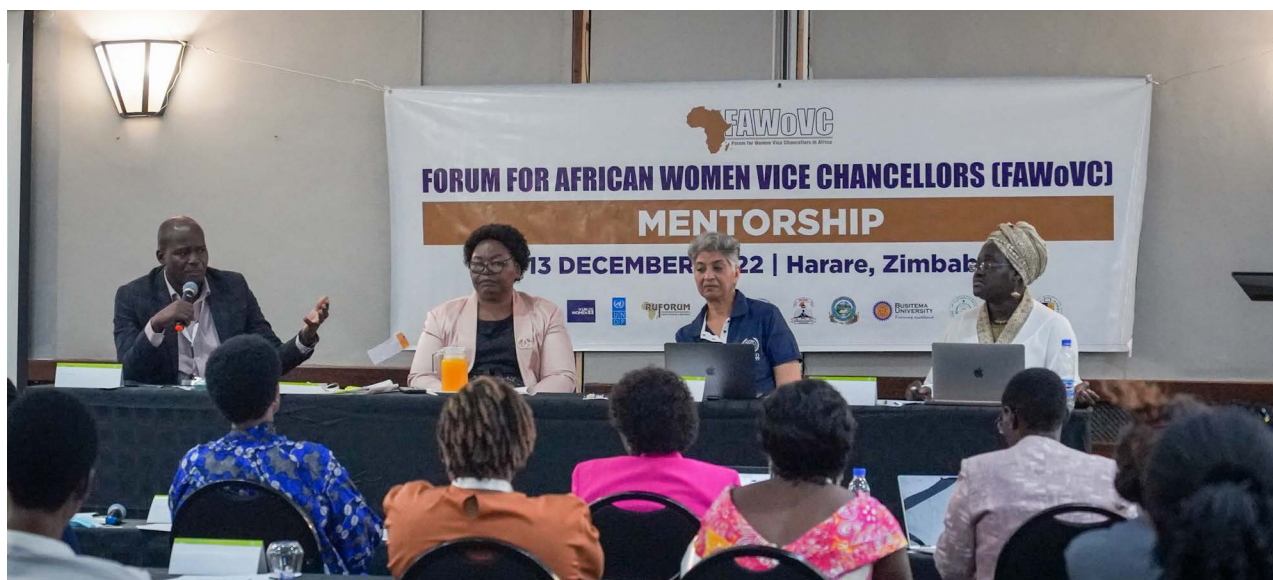
African Women Vice Chancellors holding a mentoring session with Young Women Scientists

The Scientific conference was held during the 18 th RUFORUM Annual General Meeting in Harare, Zimbabwe from 12 th to 14 th December 2022. It aimed to bring together leading academicians, scientists, researchers, and research scholars especially from the continent to exchange and share their experiences and research results on all aspects of agriculture and agricultural-related sciences, and emerging development concerns with a focus on climate-smart innovations. It was also an opportunity for graduate students to share their findings. Eight thematic areas were covered, including: i) Enhancing agricultural productivity and earnings for farming communities, ii) Strengthening the performance of livestock production systems, iii) Digital innovations in agriculture and education, iv) Environmental and natural resources management, v) Climate smart innovations, vi) Enhancing post-harvest management, value addition and nutrition, vii) Entrepreneurship and youth employability, and viii) Upscaling impact of university and community connectedness. A total of 172 oral presentations were made during the conference and 105 posters presented.