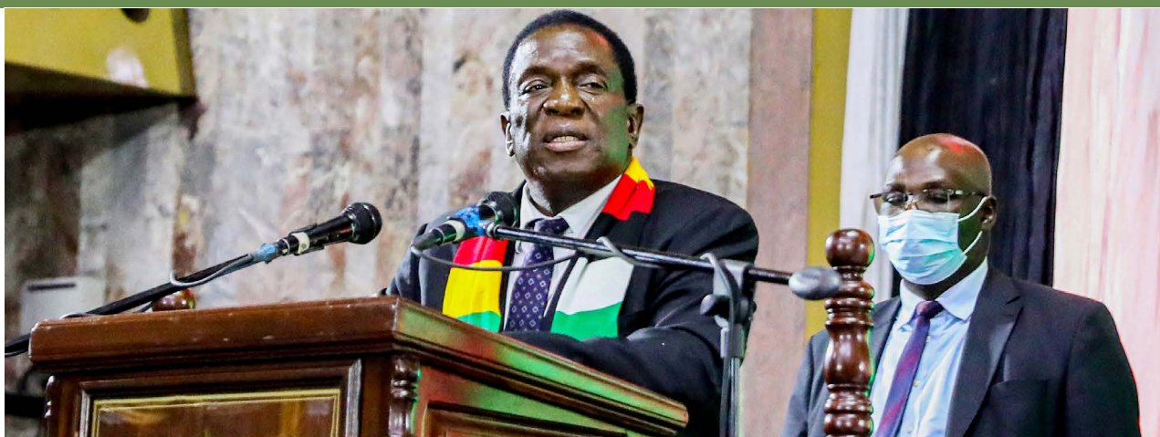
His Excellency, Dr. Emmerson D. Mnangagwa, President of the Republic of Zimbabwe officially opened the 18 th RUFORUM Annual General Meeting.

Extract from the speech by the President, His Excellency, Dr. Emmerson Dambudzo Mnangagwa on 14 December 2022 at the official opening of the Regional Universities Forum for Capacity Building in Agriculture 18 th Annual General Meeting, held 12-16 December 2022 in Harare, Zimbabwe.