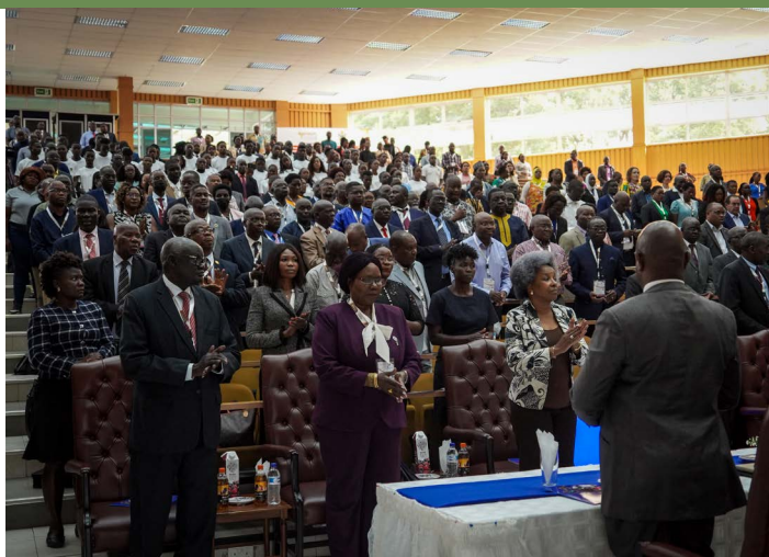
The official opening of the Scientific Conference on 12 December 2022 at the University of Zimbabwe in Harare, Zimbabwe