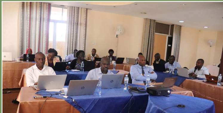
Participants in the capacity building workshop for e-learning content development and delivery at grand global hotel in Kampala, Uganda.