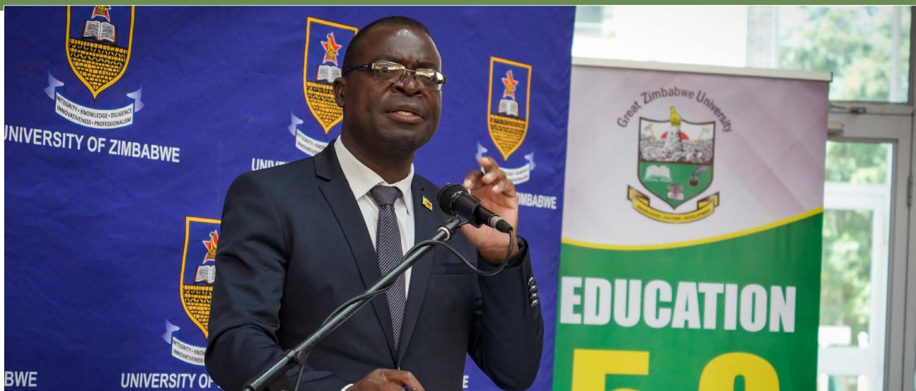
Honourable Professor Dr. Amon Murwira, Minister of Higher and Tertiary Education, Innovation, Science and Technology Development, Republic of Zimbabwe, giving a speech at the official opening of the RUFORUM Annual General Meeting.

Extract from the speech by the Minister of Higher and Tertiary Education, Innovation, Science and Technology Development, Honourable Professor Dr. Amon Murwira on 14 December 2022 at the official opening of the Regional Universities Forum for Capacity Building in Agriculture 18 th Annual General Meeting, held 12-16 December 2022 in Harare, Zimbabwe.