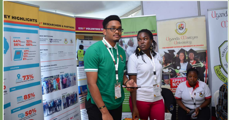
Students from Uganda Martyrs University exhibiting their innovations at the RUFORUM Secretariat in Kampala, Uganda