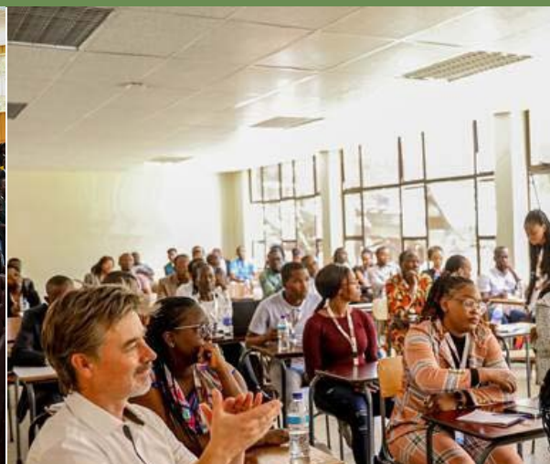
Participants attending a Scientific session at the University of Zimbabwe during the RUFORUM Annual Genereal Meeting

The Scientific conference was held during the 18 th RUFORUM Annual General Meeting in Harare, Zimbabwe from 12 th to 14 th December 2022. It aimed to bring together leading academicians, scientists, researchers, and research scholars especially from the continent to exchange and share their experiences and research results on all aspects of agriculture and agricultural-related sciences, and emerging development concerns with a focus on climate-smart innovations. It was also an opportunity for graduate students to share their findings. Eight thematic areas were covered, including: i) Enhancing agricultural productivity and earnings for farming communities, ii) Strengthening the performance of livestock production systems, iii) Digital innovations in agriculture and education, iv) Environmental and natural resources management, v) Climate smart innovations, vi) Enhancing post-harvest management, value addition and nutrition, vii) Entrepreneurship and youth employability, and viii) Upscaling impact of university and community connectedness. A total of 172 oral presentations were made during the conference and 105 posters presented.