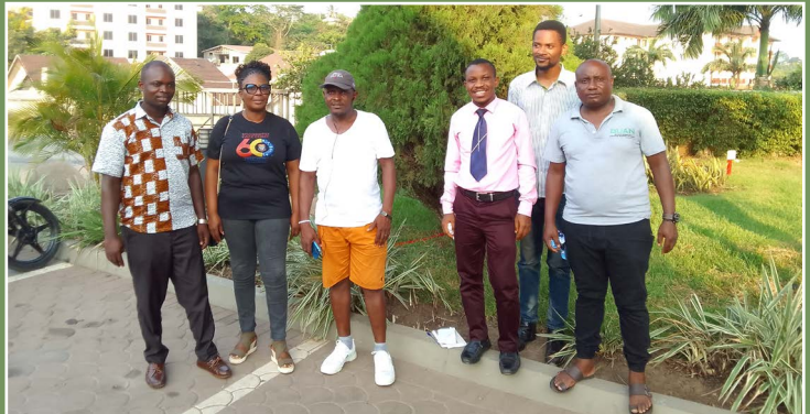
Graduate teaching assistants from Botswana, Nigeria, Democratic Republic of Congo and a post-doctoral fellow from Ghana with whom the Executive Secretary of RUFORUM met during a recent visit to Ghana.