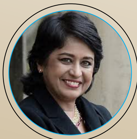
H.E. PROF. AMEENAH GURIB-FAKIM Former President Government of Mauritius