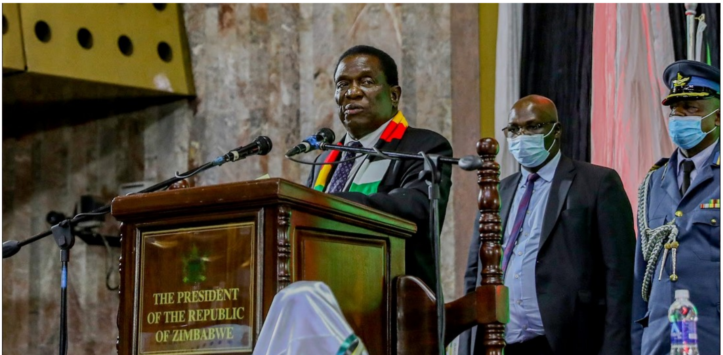
President Emmerson Mnangagwa officially opening the 18th RUFORUM AGM in Harare, Zimbabwe.

The continent of Africa has been encouraged to ensure food security and sufficiency by leveraging on the expertise of its academics and Universities. The clarion call was made by the President of Zimbabwe and Chancellor of State Universities, His Excellency President Emmerson Dambudzo Mnangagwa at the official opening of the 18th Regional Universities Forum on Capacity Building in Agriculture (RUFORUM) Annual General Meeting, in Harare on Wednesday, 14 December 2022.